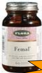
Flora Femal 60 vegi caps