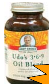
Flora Udo's Oil 250 ml