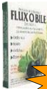
NutriPro FluxOBile 10 x 10 ml