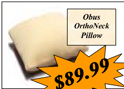
Obus OrthoNeck Pillow