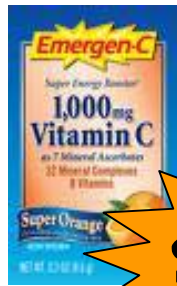
Emergen-C Packets 8.6 grams