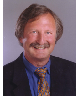
Jacob Teitelbaum M.D.

These are the 5 key areas that need to be treated to restore energy so that your "circuit breaker" can turn back on and for fatigue and pain to resolve.