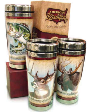
Steel travel mug shown. Coasters, thermos sets & more available!